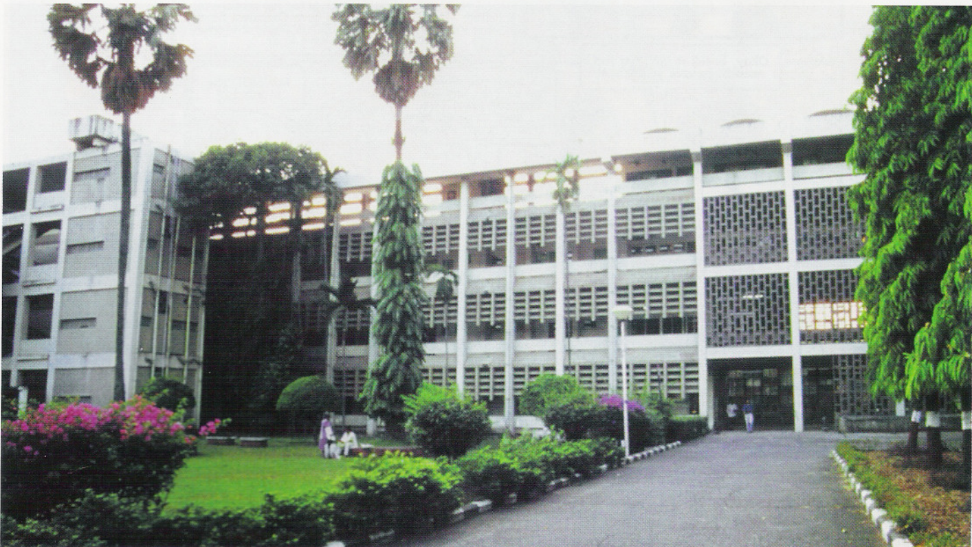
The administrative building of IIT Bombay.

It retails for $60, but the authors are working with IIT alumni associations on discount plans.